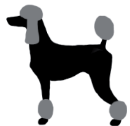
Summer (other names Clown, Miami, etc.)