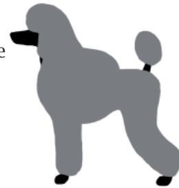
Intermediate (sometimes seen at shows)