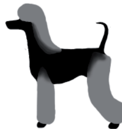
German (clipped tail & ears)